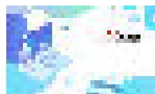
NIC-EVS71-10G OCH Nonstandard Network Card Module